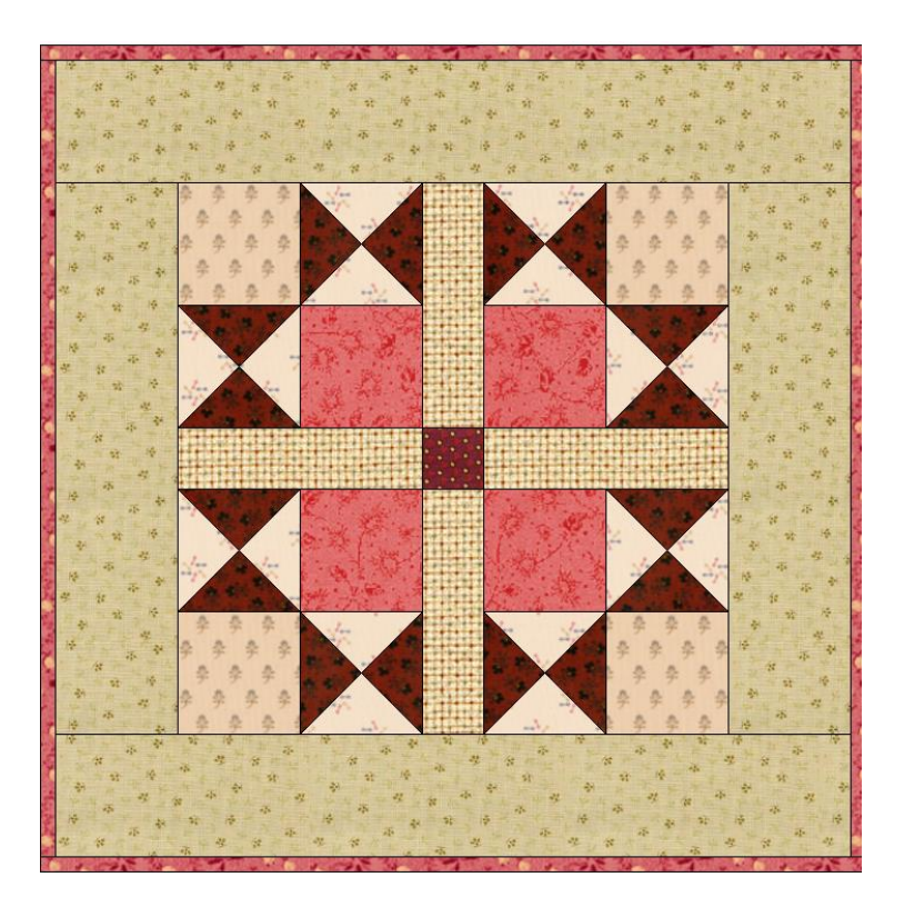
For an inner border, cut 1" strips or as wide as you prefer. Then measure and add outer borders.