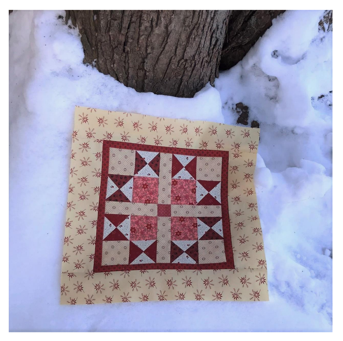
Happy Valentine's Day!